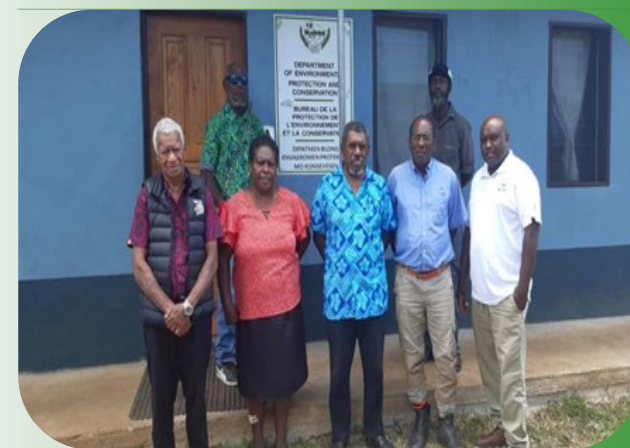
Efate, CCA management committee (ECARE potential target CCA)