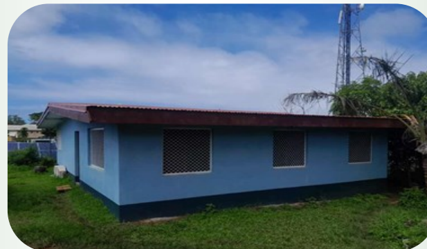
The FAO GEF 5 ISLCM and ECARE Projects Office Building

To improve systems and capacity at all levels to achieve a representative, effective and expanded protected areas network in Vanuatu .